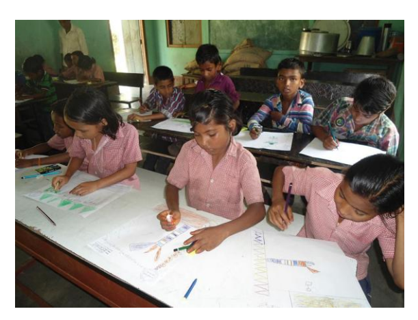
Student Participating in Drawing Competitions