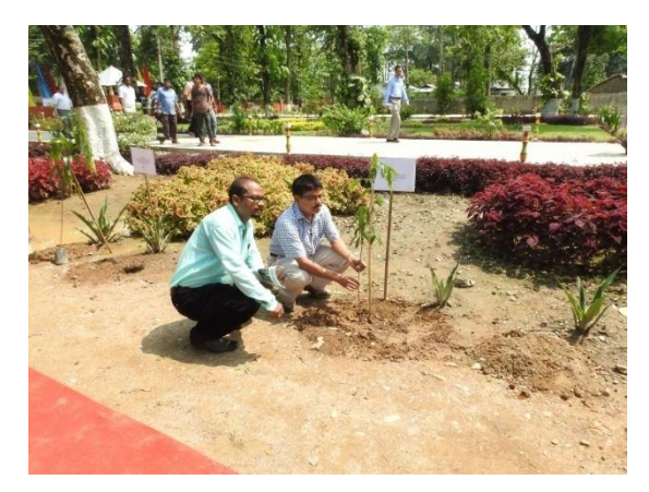
Plantation by villagers & other officials

5. Seeds & Seedling Distribution: The programme ended with the free distribution of rare species of seedlings in a biodegradable non-oven cloth bag and seeds of valuable trees species were distributed in packets to the general public.