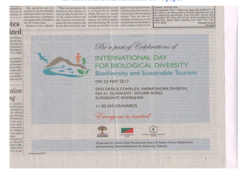
Invitation in Assam Tribune news paper