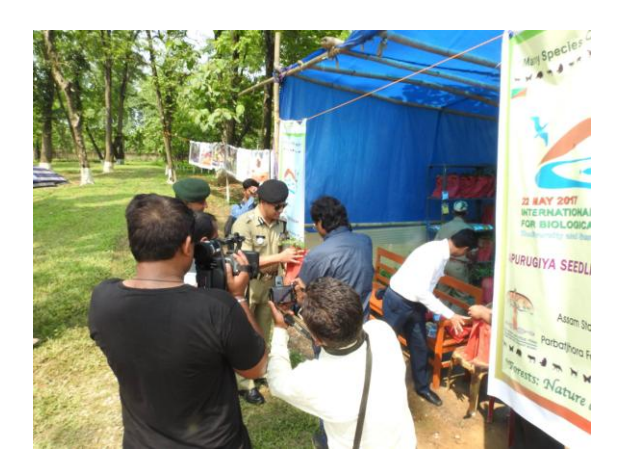
Seeds & plant saplings distribution