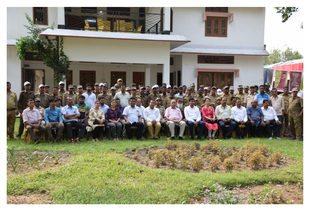
IDB , 2017 Celebration Team